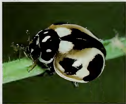
Adult lady beetle ( Cycloneda ancoralis sp.) feeding on a grain aphid.